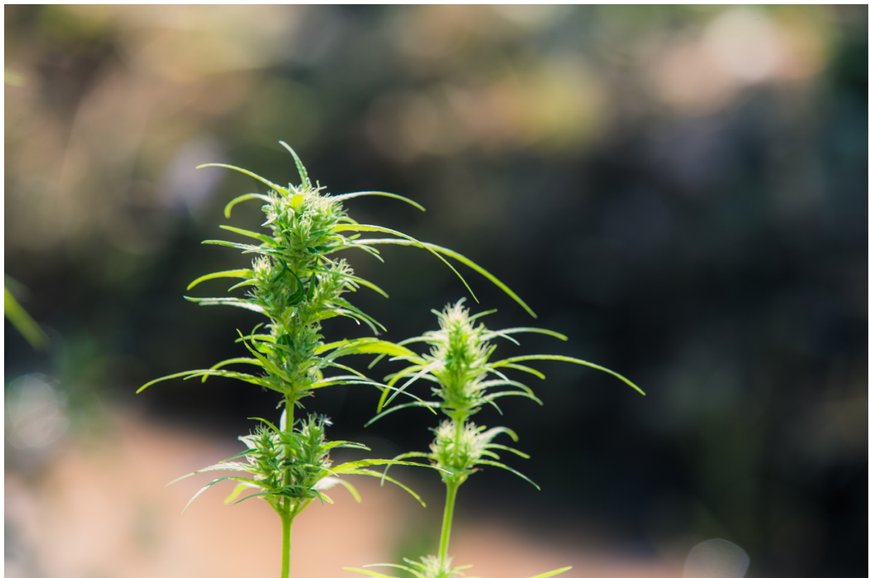
Growing your Mind-Blown Marijuana Outdoors

Once the clone has developed roots of its own, the differences in growing disappear as you already have another new plant that will sprout flowers for you.